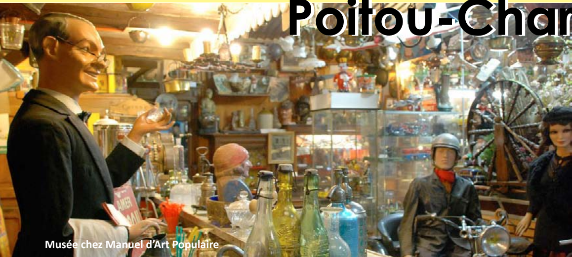
Musée chez Manuel d'Art Populaire