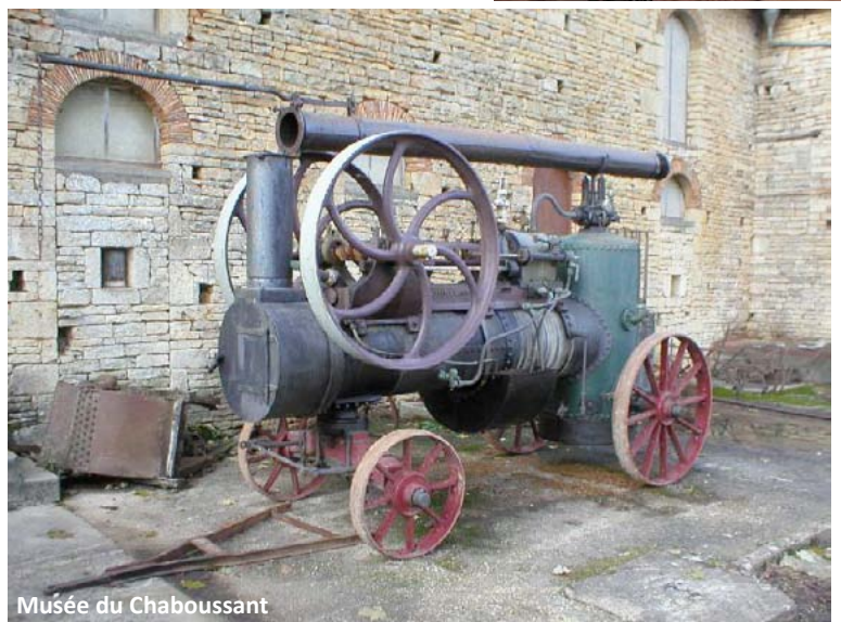
Musée du Chaboussant