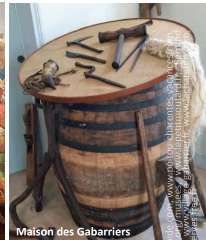
Maison des Gabarriers