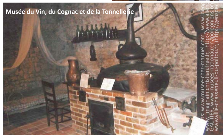
Musée du Vin, du Cognac et de la Tonnellerie