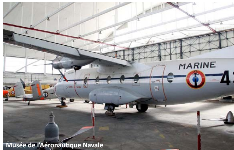
Musée de l'Aéronautique Navale