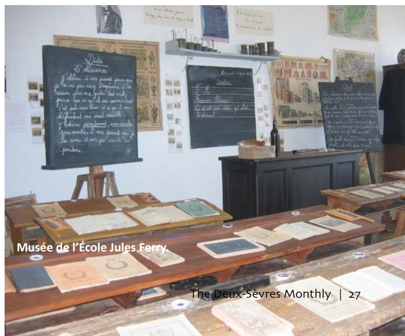
Musée de l'École Jules Ferry