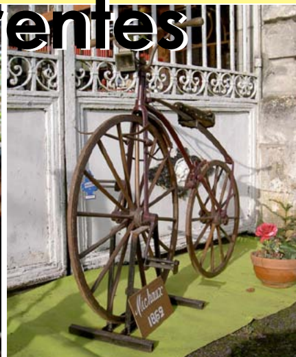
by Mick Austin

Gone are the days when museums had an often deserved reputation for being dull, musty places you'd only visit to escape torrential rain or a snowstorm. Many of today's offerings can often seem quite similar. You know, paintings, porcelain, bits of chipped bone etc. But there are some gems out there. Museums celebrating the quirky and often quite weird. From wireless to wheels, macaroons to mother of pearl and fire-fighting engines to flat-bottomed boats, there's something for everyone.