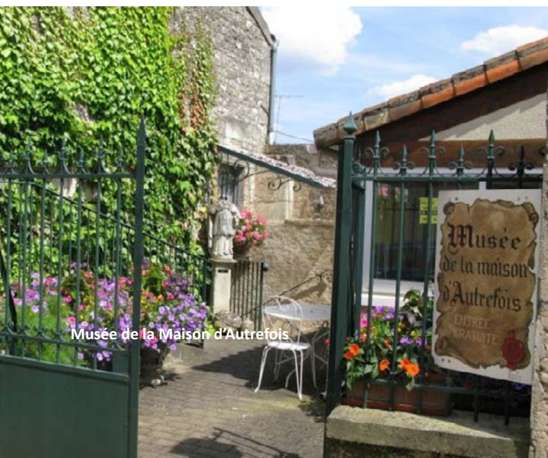
Musée de la Maison d'Autrefois