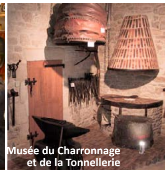
Musée du Charronnage et de la Tonnellerie