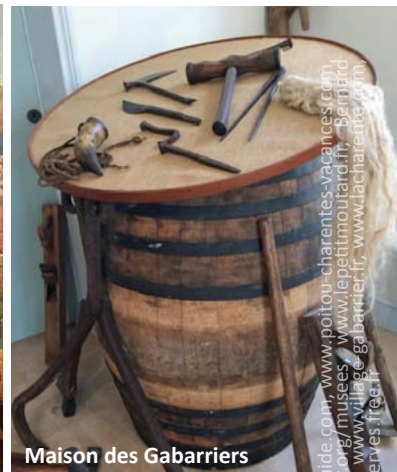
Maison des Gabarriers