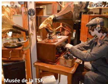
Musée de la TSF.

Place de la Payse, 79120 Lezay. Website: www.magnain.christian.free.fr