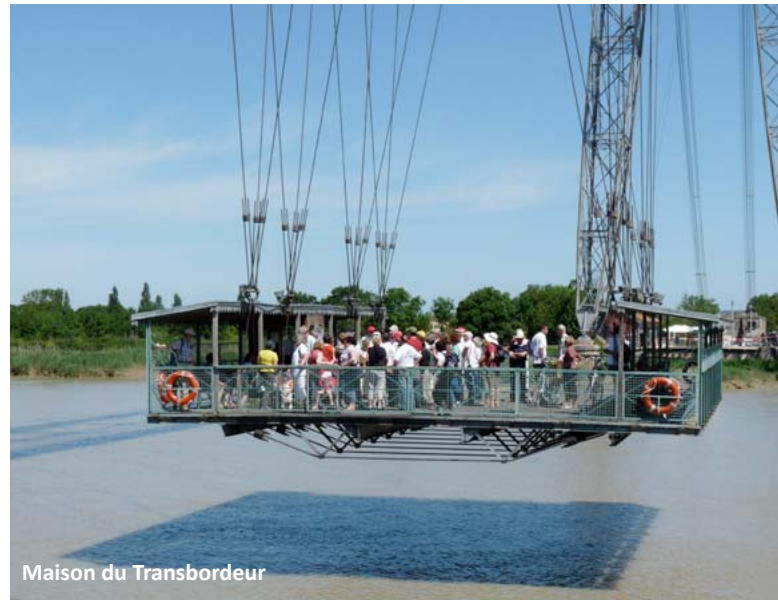
Maison du Transbordeur

Domaine de Plaisance, 16300 Lamérac. Tel: 05 45 78 04 61.